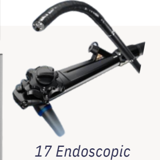
17 Endoscopic Cameras are needed!